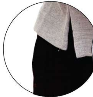
Side slits with bartack

Executive wear. Premium quality. No-fuss performance. Creaseless.