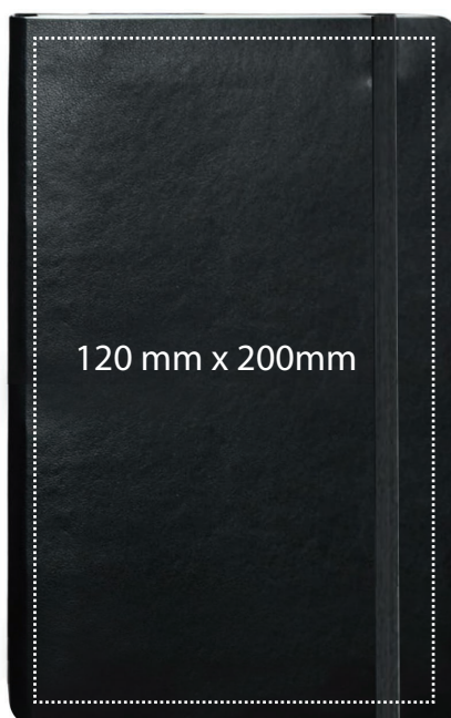
Print Area A ( Front )