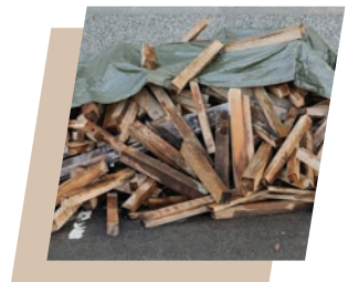
FSC UPCYCLED BEECH WOOD