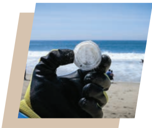
RCS RECYCLED PLASTIC BOTTLE LIDS