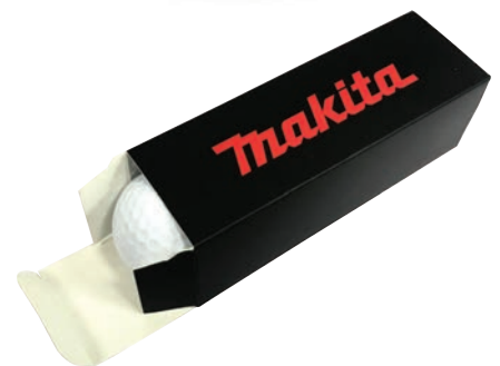
ODDER GAGB 975 - GOLF BALLS 2 layer Golf balls. Set of 3 Golf balls in customised paper packaging