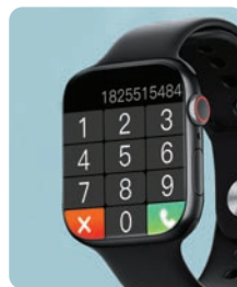
Smart voice calling