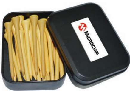
GATE 237 - KRANJI - Set of 30 wooden 7cm golf tees in a tin gift box Print Technique: EPOXY Preferred Print Location: On Box Max Print Size: 24 x 55 mm