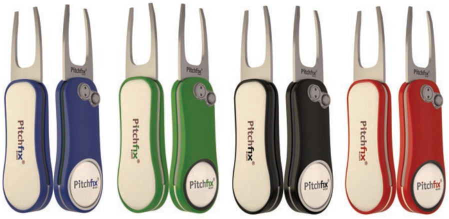
GAPF 566WL Blue GAPF 568WL Green GAPF 565WL Black GAPF 567WL Red