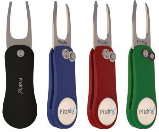
GAPF 561WL Black GAPF 562WL Blue GAPF 563WL Red GAPF 564WL Green