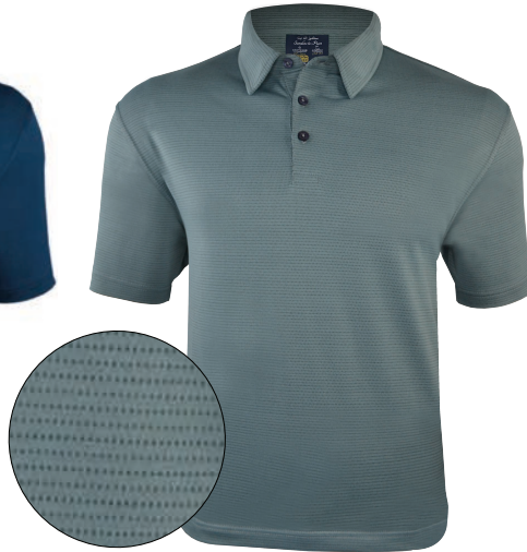
Special textured 2-tone knit fabric