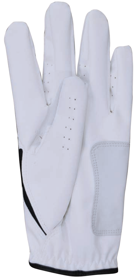
GAGV 981 - OSASCO - Golf Gloves, Left - Medium Size GAGV 993 - OSASCO - Golf Gloves, Left - Large Size