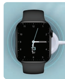
Includes Wireless Charging