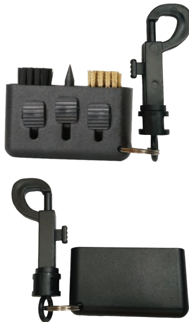
RONNE GAMT 976 - GROOVE TOOL Plastic groove cleaner with an extendable brush, spike, wire brush and with carabiner.