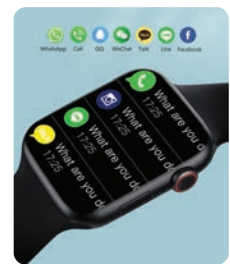
Syncs with your mobile