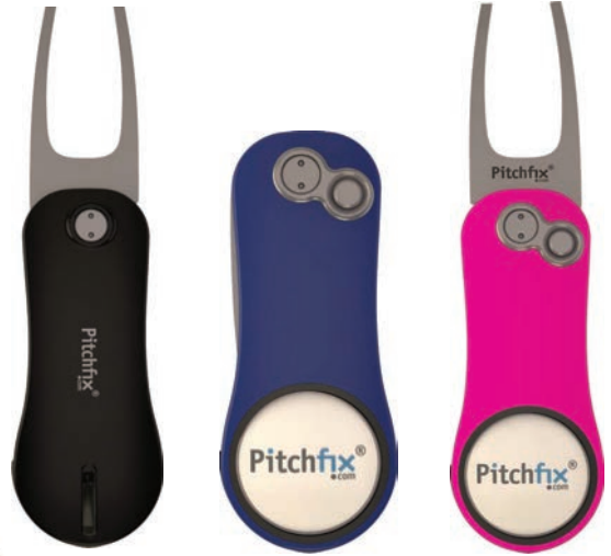
GAPF 572WL Black GAPF 573WL Blue GAPF 574WL Pink