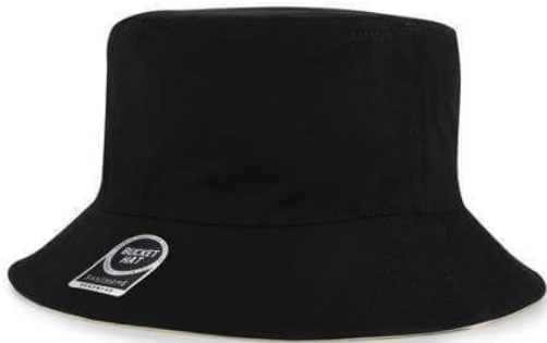
HWSN 4001 Black & White