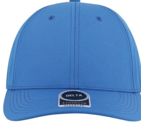
HWSN 4007 Marine Blue