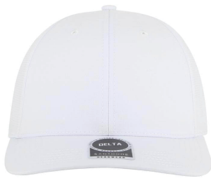
HWSN 4002 White