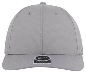
HWSN 4005 Grey