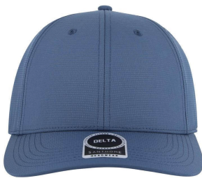
HWSN 4003 Navy Blue