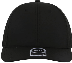
HWSN 4006 Black