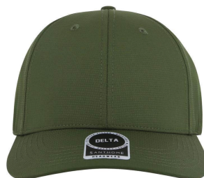
HWSN 4004 Green