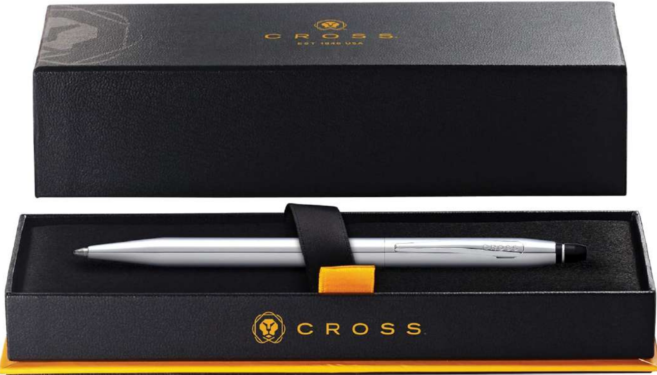
Packed in a premium gift box

A modern design update to a classic icon Easy-to-use click mechanism, the first of its kind by Cross Stylish colors combined with our best-selling finishes