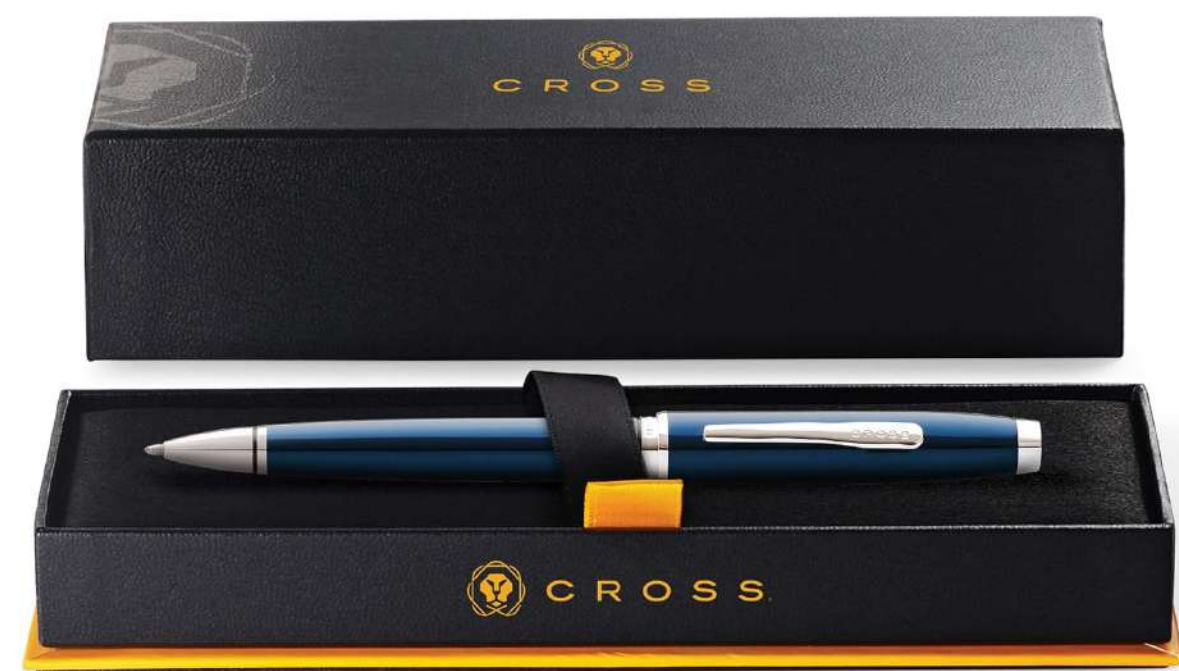
Comes in an elegant box packaging